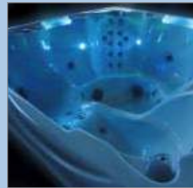
DynaStar LED Lighting