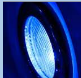
12 V Spa Light