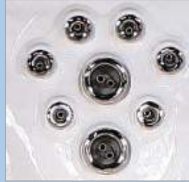
Stainless Steel Jets