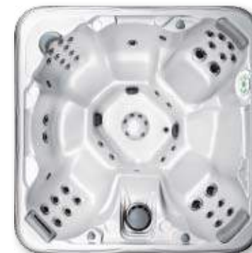
748 B / 748 L